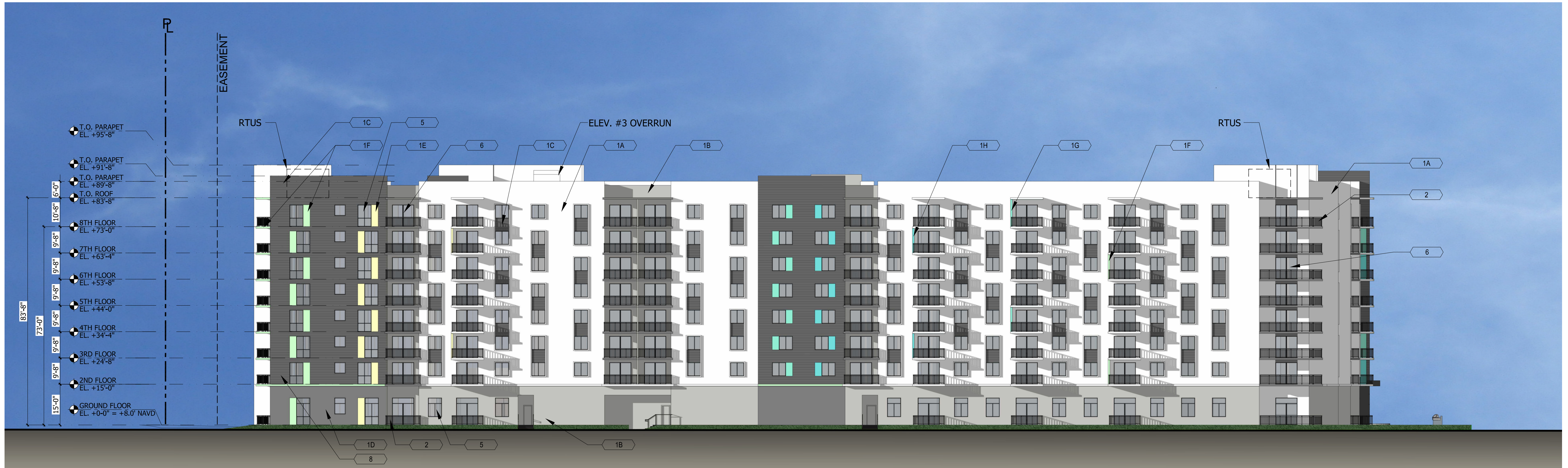
1 NORTH ELEVATION SCALE: 1"=20'-0"