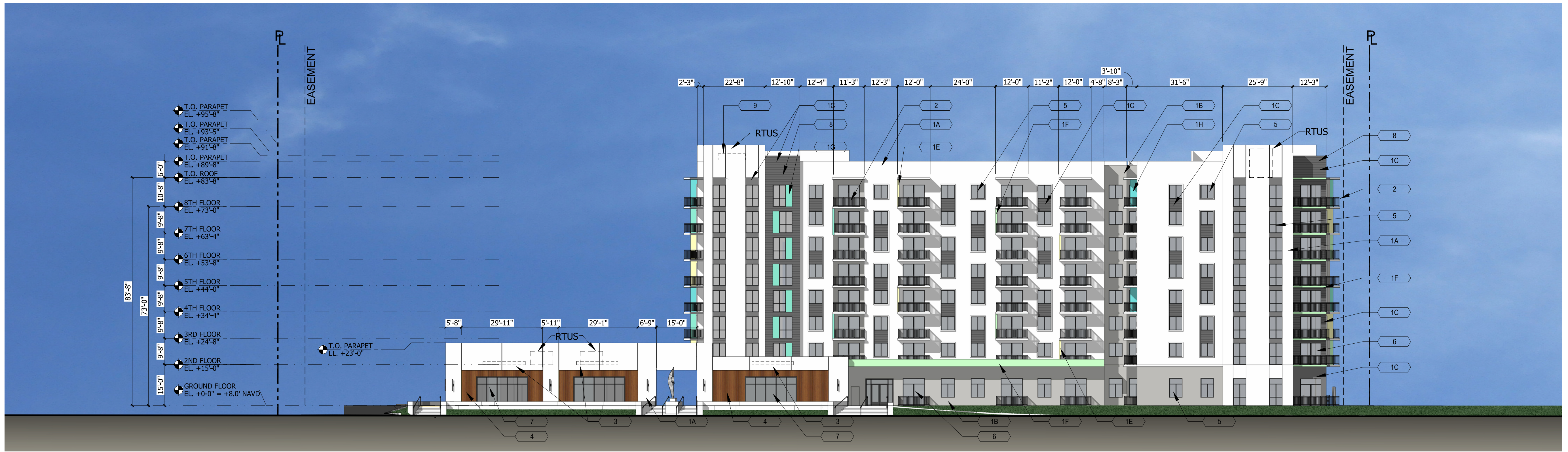
2 EAST ELEVATION SCALE: 1"=20'-0"